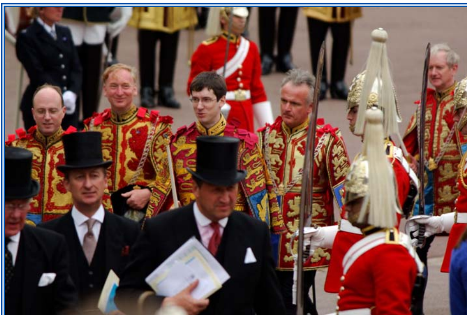
Some of the Officers of Arms returning to the Upper Ward of Windsor Castle following the Garter Service (see above).

Changes of Name: it is necessary for institutions to record at the College of Arms any alteration to their names, to ensure that their right to Arms is properly established and maintained. The following bodies are among those that have recently recorded such changes of name: The Institute of Plumbing became The Institute of Plumbing and Heating Engineers; James Cook University of North Queensland became James Cook University; the Territorial and Volunteer Reserve Association for Greater London became the Reserve Forces and Cadet Association for Greater London; the British Institute of Architectural Technologists became the Chartered Institute of Architectural Technologists.